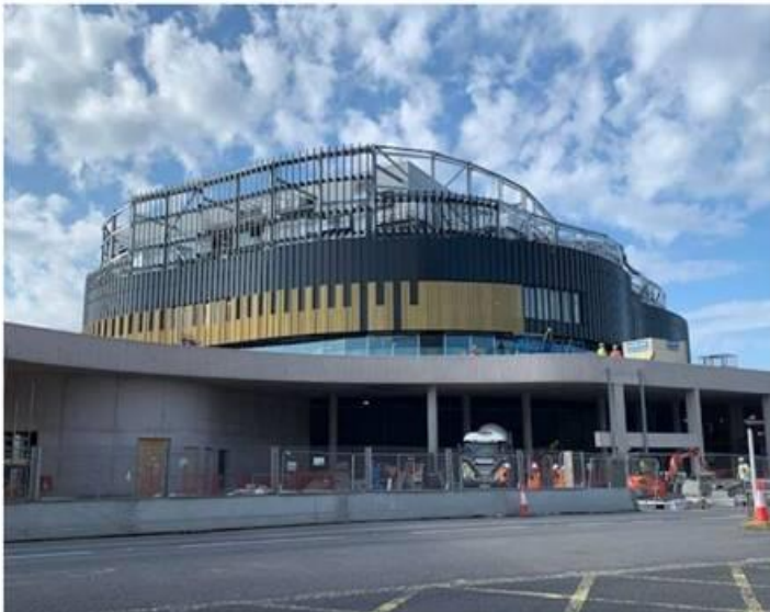
Arena – cladding / LED's being installed

Planning permission for Innovation Matrix progressing.